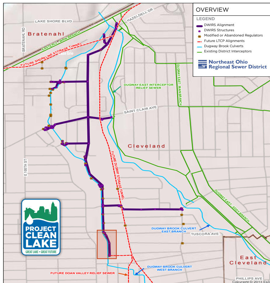
Project Clean Lake plan overview of DWIRS with location of curved microtunnel segment highlighted. Southern end runs close to existing culvert

Because of the project specific soil conditions and elevated water table, two Microtunnel Boring Machines (MTBMs) with capability to continuously pressurize the mining face were used. The first MTBM drive was launched in August 2014 from a 45-foot deep secant pile shaft with an Akkerman SL60 MTBM. The SL60 was used throughout the project for the 48-inch RCP sewer, including a 915 LF run through shale, while an Akkerman SL74 was deployed on all the 72-inch drives including the 700 LF of curved microtunnel. Both MTBMs were equipped with an increase kit so that the final bore diameter would accommodate the outer bore diameter of the jacked pipe. The machines performed very well in the various ground conditions encountered during tunneling operations.