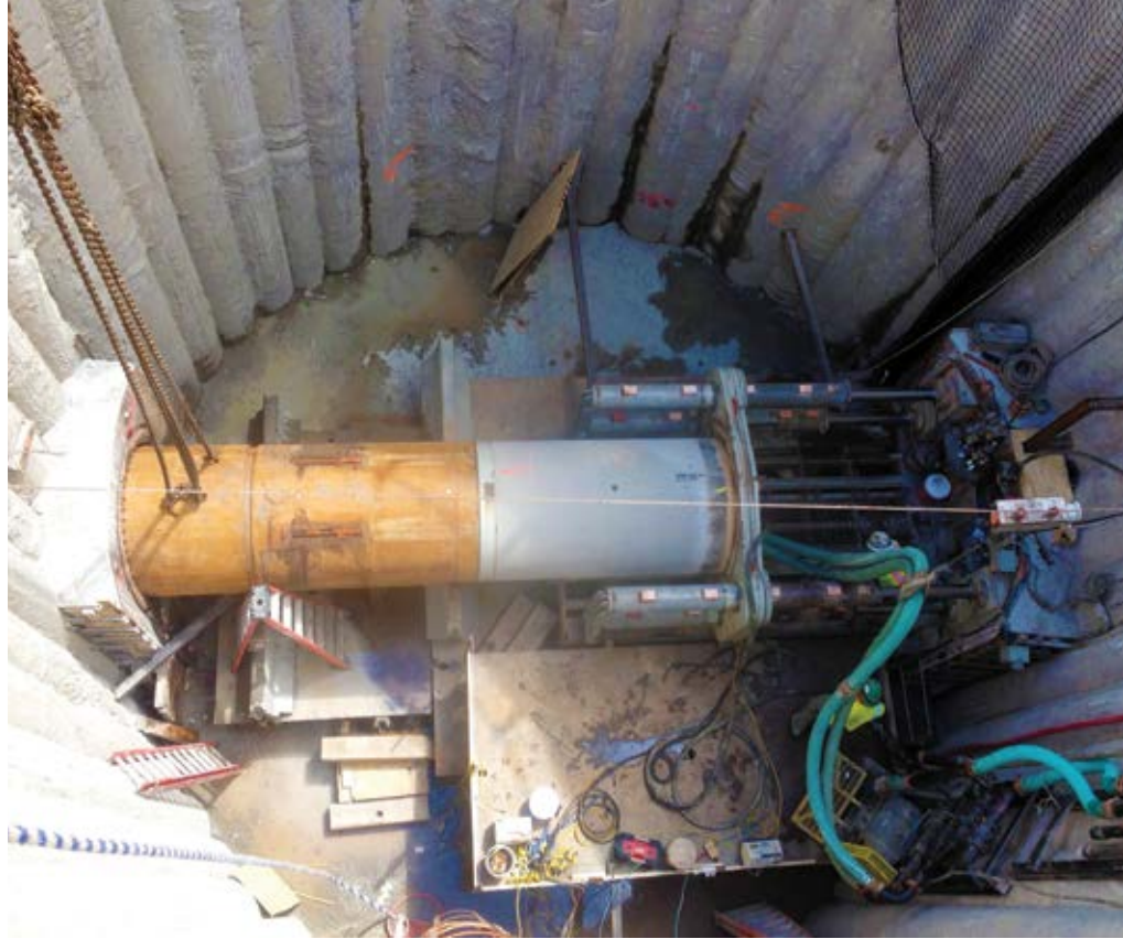
First MTBM launch August 15 2014 from a 45 foot deep secant pile shaft using an Akkerman with an MT860K jacking frame