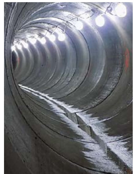
Tunnel has curve radius of 915 feet. 8 Foot segments of 72-inch RCP were jacked in the curved section