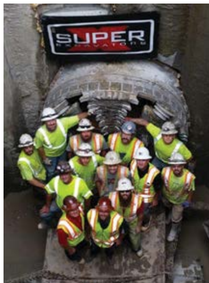
Break out at PM 16 receiving pit celebrated by SEI crew after completion of curved tunnel drive with an Akkerman SL74 MTBM

Once design was approved for curve approach, SEI purchased a VMT navigation system to assist with the MTBM guidance. VMT was a big contributor to the success of the curved microtunnel, as they provided onsite survey support for the duration of construction. Said Kolster: "VMT was critical in making this successful."